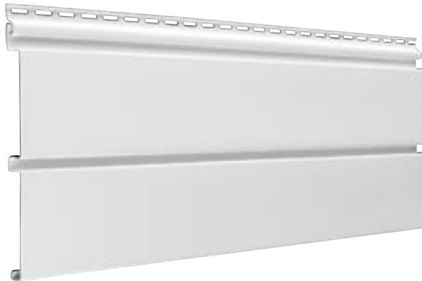
UltraSpan D5" Solid and D5" Hidden Vent

Finishing Touch | Enhance your home with UltraSpan premium vinyl soffit by NAPCO®, available in the following profiles: