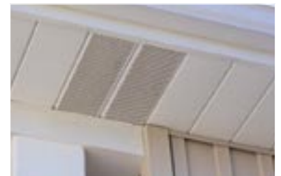
ULTRASpan PREMIUM SOFFIT WITH ELUSIVENT VENTILATION