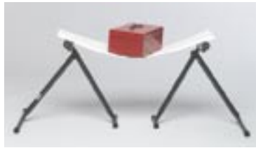
Rigidmaster helps UltraSpan panels go the distance.